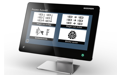
iS75 with BRAIN2 Formulation