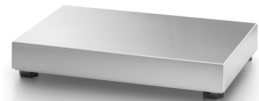
iL Economy 300F/SP Type2

Single point load receptor iL Economy 300F/SP Type2 is suitable for applications in dry or wet areas. The dry area version consists of galvanized steel and an aluminum load cell. Load carriers and load cells of the model intended for wet areas are made of stainless steel. This version offers protection up to IP69 to withstand even harsh environments. The s/s bell-shaped platform visible to the user is part of both versions. Due to the built-in spirit level, the iL Economy 300F/SP Type2 can be flexibly used and be optimally adjusted to the conditions of the installation area. The load cell is also available as Ex version which allows the use in hazardous areas classified as zones 1/21 and 2/22.