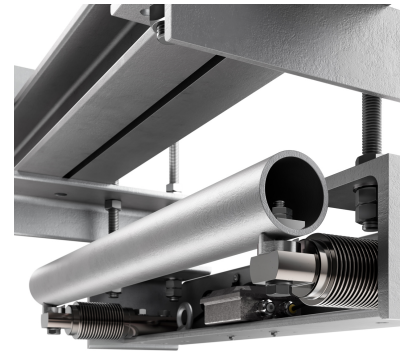
iL Special 1000O/MP