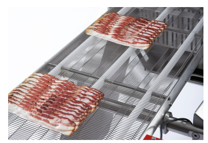
Slicing result A560