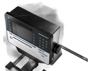
Weighing terminal can be rotated by 330°