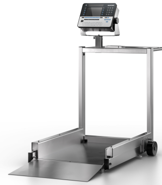
iL Special 750M/MP

Numerous applications require mobile weighing systems. Complex installations and long transport distances to centrally stationary weighing installations can be reduced to acceptable levels or ca perhaps be avoided. The mobile floor scale iL Special 750M/MP is especially suitable for products up to 600 kg and short driving distances allowing maximum maneuverability even in smaller areas. In addition to mains operation, the mobile floor scale can also be battery-operated. Quick change to battery operation thanks to easy-to-remove battery box with handle. For use in the chemical and petrochemical industry an explosion-proof version for mains or battery operation is available. When changing the weighing location the entire mobile system must be tilted with the drive-on ramp in raised position.